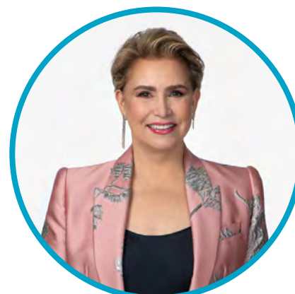
Her Royal Highness Grand Duchess Maria Teresa of Luxembourg

South African Rugby Star and Regional Goodwill Ambassador, UNICEF