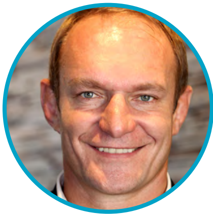
Francois Pienaar World Cup-winning Springbok captain and social justice campaigner