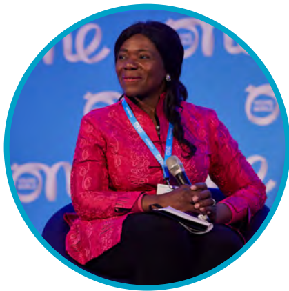
Professor Thuli Madonsela Former Public Protector of South Africa