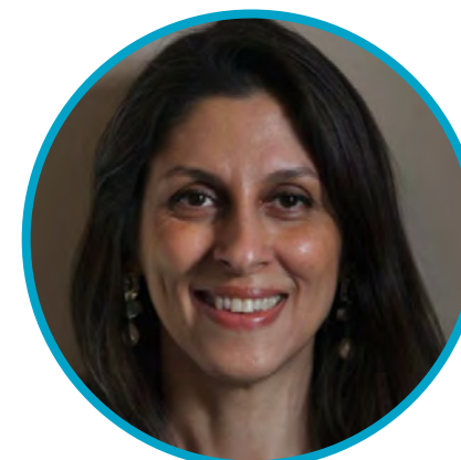
Nazanin Zaghari Ratcliffe

Nobel Peace Laureate and Co-Founder and CEO, Rappler