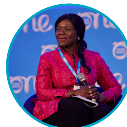
Professor Thuli Madonsela

Advocate, High Court of South Africa and Former Public Protector