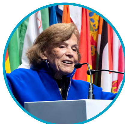
Dr Sylvia Earle

Fashion Model and Mental Health Advocate