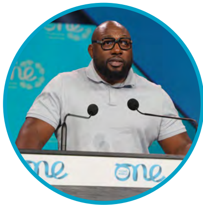
Tendai Mtawarira South African Rugby Star and Regional Goodwill Ambassador, UNICEF