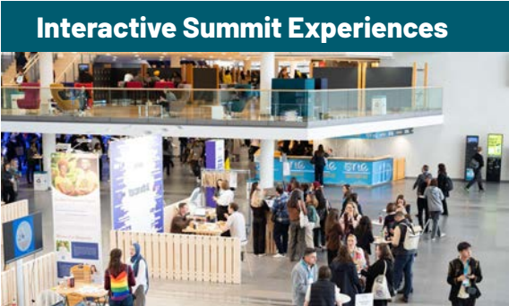
Engage with Delegates through exhibitions and stages