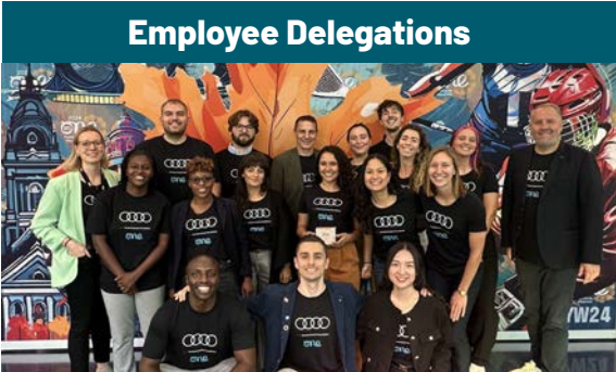
Send high-potential talent to the Summit