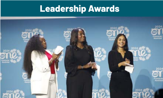
Champion groundbreaking young leaders