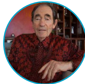
Justice Albie Sachs

Legendary Actor, Playwright and Advocate for Social Justice