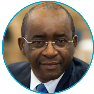
Strive Masiyiwa Founder & Executive Chairman, Econet Group