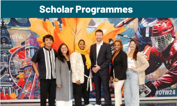
Create branded scholarships for external talent